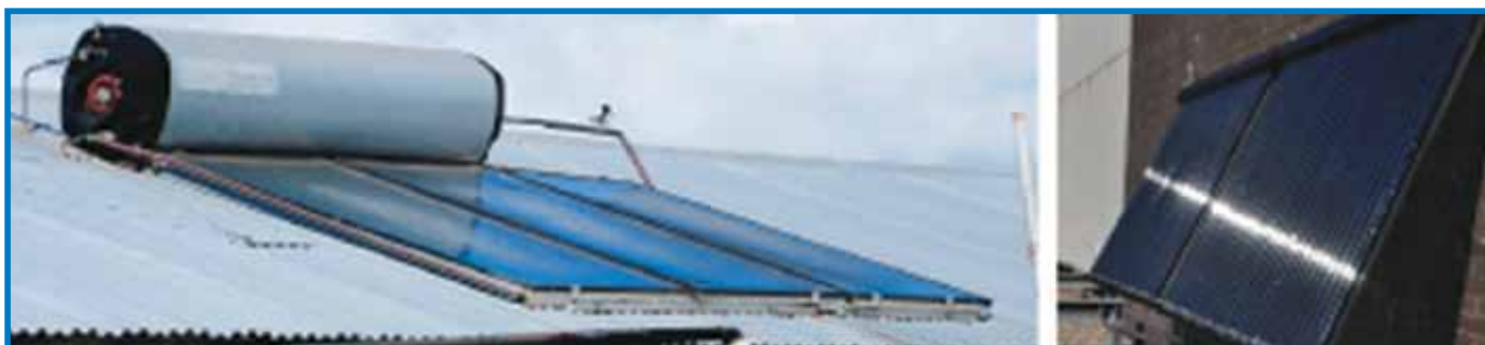
A flat plate collector solar hot water system.