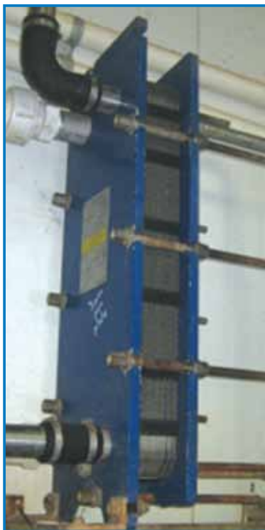
A plate cooler.

Cooling milk from 35 °C to 4 °C accounts for the biggest proportion of total dairy energy costs (30–60 per cent). Designing and operating an efficient milk cooling system can reduce energy demand and operating costs. In many cases the cooling system needs to be evaluated to ensure it is working efficiently and not costing you money.