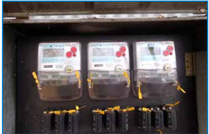
Above is an electricity metre.

TOU tariffs require polyphase meters. Normally these meters are provided free by the energy supplier, but the cost of installation is borne by the customer. A Class 2 electrician is required to change meters.