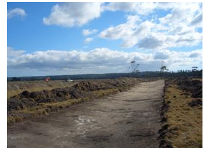
Constructing a hump and hollow drainage system in Tasmania