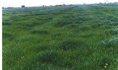
Hump and hollow drainage - Victoria

The humps and hollows system comprises lateral surface drains which discharge into headland drains which in turn discharge via short open drains or shallow pipes into natural watercourses or open drains.